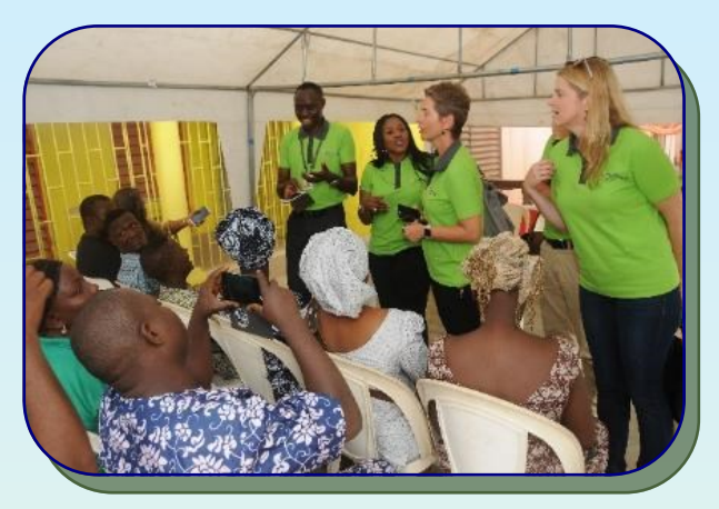
Diamond Bank and Women World Banking Executives with a cross section of customers at the Diamond Closa Launch

Diamond Bank launches agency banking business model 'Diamond Closa', co-hosts "Banking with Women Event"