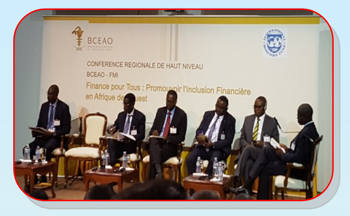
IMF, BCEAO Regional Conference to promote financial inclusion in West Africa (Sept. 2016 - Dakar, Senegal)