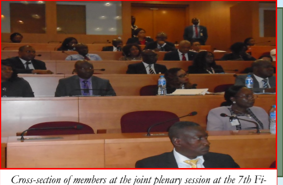
Cross-section of members at the joint plenary session at the 7th Financial Inclusion Working Group meetings

The four Financial Inclusion Working Groups held their 7th meetings at the International Training Institute of the CBN in Abuja on 21stth September, 2016.