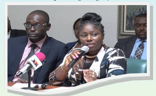
Round Table on Financial Inclusion hosted by the Nigerian Institute of Advanced Legal Studies (Aug. 2016-Abuja, Nigeria)